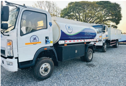
Fuel bowser & cargo truck for aviation logistics.