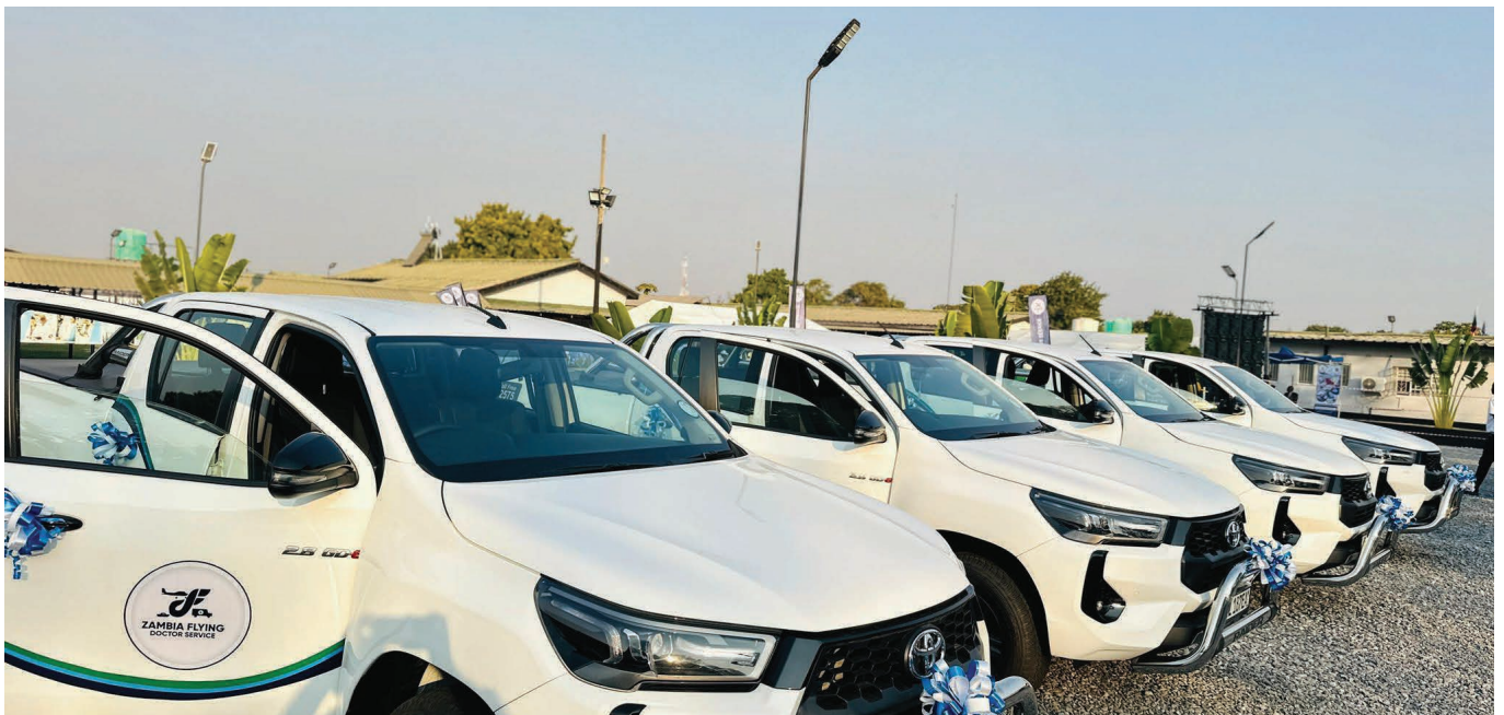
A new chapter. New utility vehicles, ribboned for handover, join the ZFDS fleet under the Government recapitalisation programme.

A Government recapitalisation drive is reshaping the Zambia Flying Doctor Service — new aircraft, vehicles, refurbished wards and two commissioned hospitals are widening access to care in urban and rural Zambia alike.