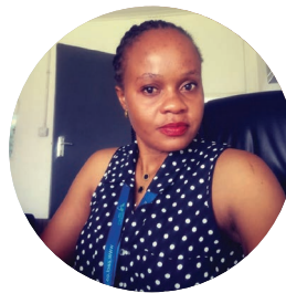
Juliet Mumba CONTRIBUTING WRITER