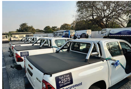
A line of utility pickups for field operations.