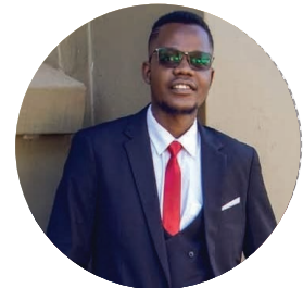
Lovemore Sondashi CONTRIBUTING WRITER