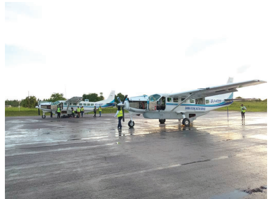
The Caravan fleet — workhorse of ZFDS aeromedical evacuations.

ZFDS crews carried the most critical of patients to specialist care by Caravan and by helicopter, day and night.