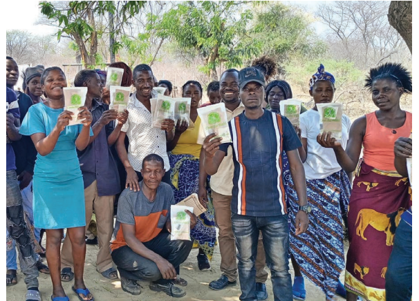
In the community. A ZFDS field team at a public health outreach point.

The support, she said, directly aligns with the Ministry of Health's mission of bringing quality healthcare closer to the people. The donation was made to both ZFDS and the Churches Health Association of Zambia (CHAZ).