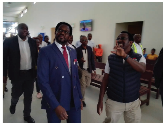
On tour. Government officials and stakeholders at Ng'anga Bilonda Hospital, Mwanabombwe.