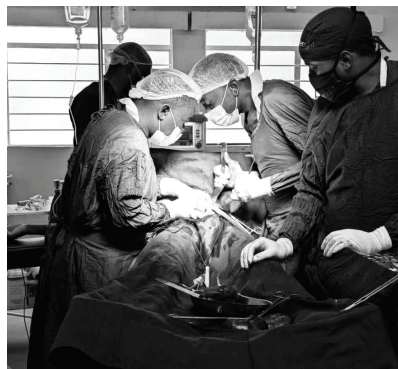
No time to wait. Managing a rapidly spreading infection at Luyaba.