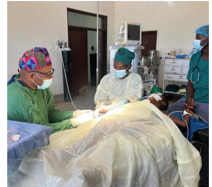
Careful hands. A contracture release during the Chama outreach.