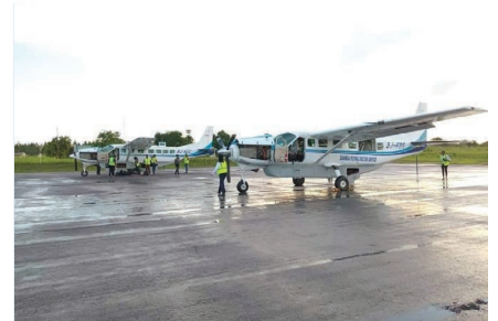
Cessna Caravans ready on the apron at first light.