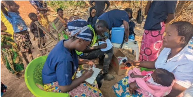
Outreach teams bring care directly to remote communities.

In Zambia's remote provinces, where the nearest clinic can be a half-day away and an emergency is measured in hours, ZFDS has grown from a modest emergency-response unit into one of the country's most impactful rural health-delivery organisations.