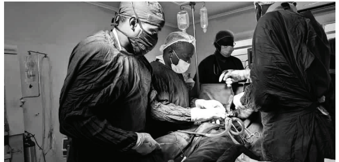
Emergency response. ZFDS crews stabilise critically injured patients for transfer to specialist surgery.

A 32-year-old man with a penetrating stab wound to the chest had lost more than 1.5 litres of blood and was in severe respiratory distress. He needed an open thoracotomy unavailable locally.