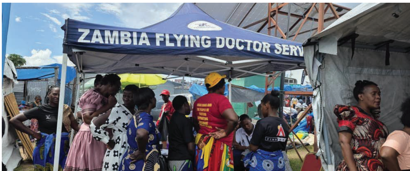
At the ZFDS tent. Community members receive free care during the Kuomboka period in Western Province.

Traditional ceremonies draw thousands from across the country — and offer a rare chance to bring essential services close to communities that are often underserved. ZFDS has made it a priority to partner with these occasions.