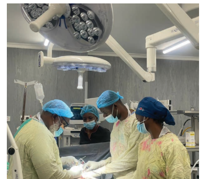
Two operations, one theatre. The team at Ng’anga Bilonda Hospital.