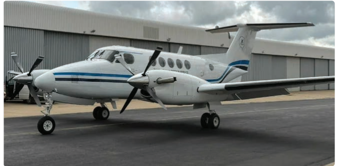
Light aircraft reach airstrips far beyond the road network.