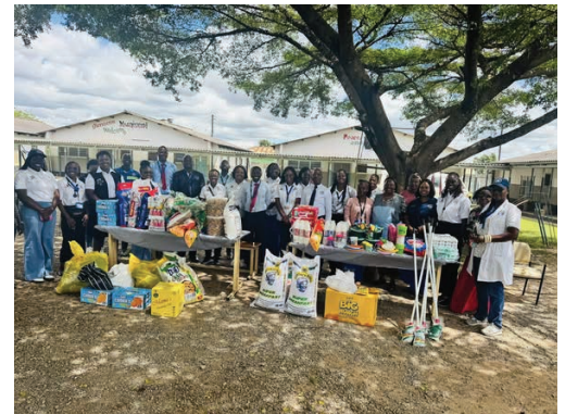
Donations delivered. Staff present supplies funded through voluntary contributions.

Management at the village which cares for 103 children, many with special needs expressed deep gratitude. The ZFDS medical team conducted full-day health screenings, including eye and dental assessments, while the visit offered something equally vital: reassurance, attention and human connection.