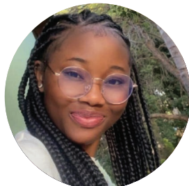
Trina Sianyeuka CONTRIBUTING WRITER